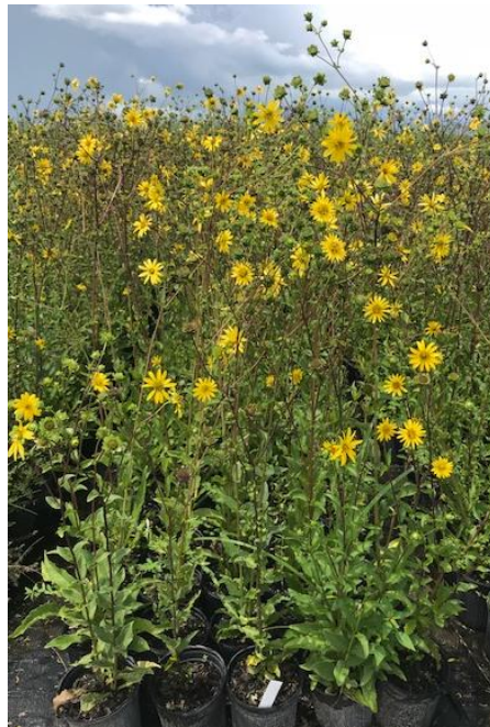
The cheerful yellow flowers of the Silphium astericus (Starry Rosinweed) reach 3 feet tall and offer great butterfly nectar plant. Loved by Swallowtail butterflies, honeybees, and many other pollinators. 200 – 1g available @ $2.35 each.