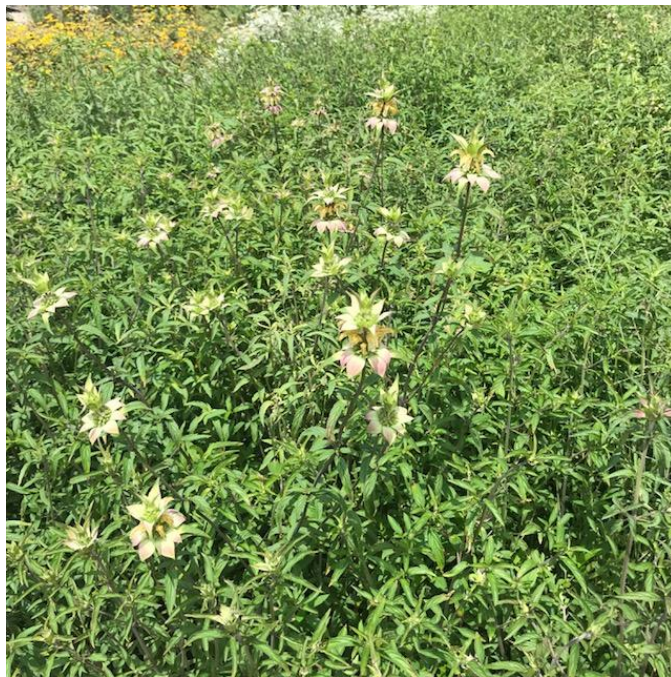
Monarda punctata (Dotted horsemint) may not be as showy as some of our other perennials, but it is still loved by a huge assortment of pollinating insects. 200 – 1g available @ $2.35