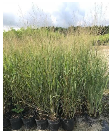
Panicum virgatum 'Heavy Metal'

Planting native grasses is for the birds....Literally! These low maintenance landscape additions provide abundant seeds that birds enjoy. Attractive in small or mass plantings. Large selection of 1g grasses available @ $2.10 each