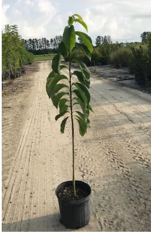
Asimina triloba (Pawpaw) is a great small native tree. Edible fruit has a tropical flavor. Also a host plant for Zebra Swallowtail. 3g available @ $8.75 each