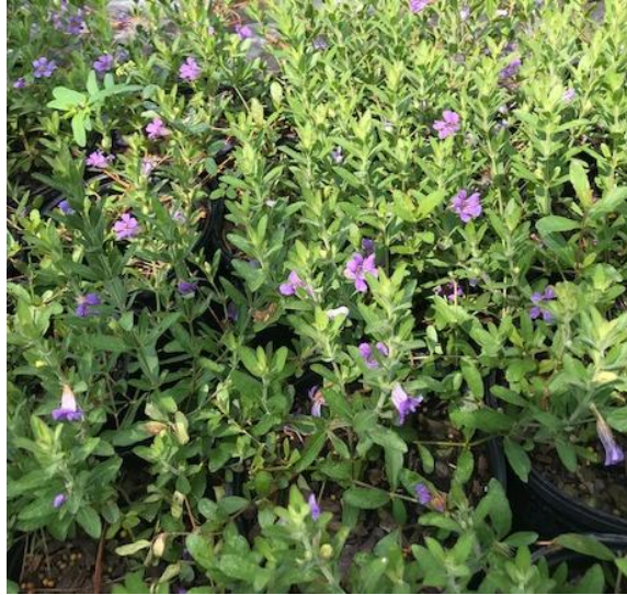
Dyschoriste oblongifolia (Twinspur) is another nice groundcover that blooms throughout the summer. Thrives in either partial shade or full sun and is drought tolerant. Attracts butterflies and bees and is the host plant for the Common Buckeye. 150 – 1g available @ $2.35 each.