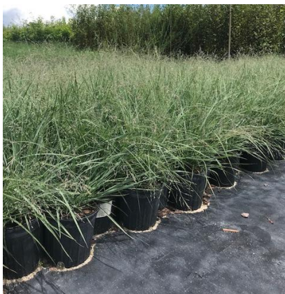
Eragrostis elliottii (Elliotts lovegrass)