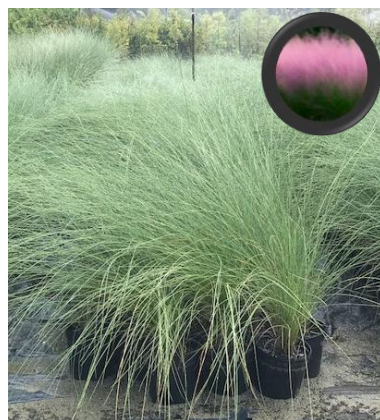
Muhlenbergia capillaris (Muhly) (picture denotes bloom color)