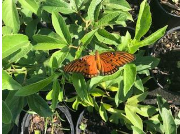
Passiflora incarnata (Passionvine) is a great butterfly nectar plant as well as a larval host for the Gulf Fritillary butterfly. 1g - 300 $2.85 (staked)

Edible alert! Fragaria virginiana (Native Strawberry) offers delicious berries and beautiful red fall color. 1g - 250 available @ $2.35 each